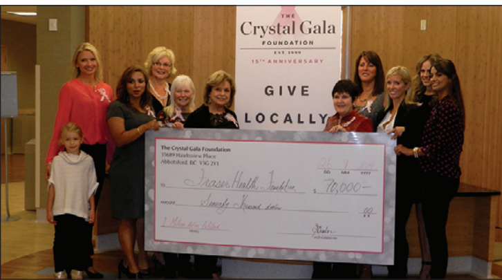
The Crystal Gala Foundation's $70,000 gift completed their $1 million pledge to the Crystal Gala Breast Health Unit at Abbotsford Regional Hospital.