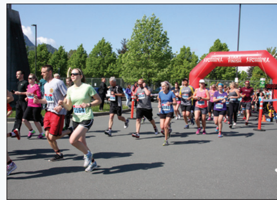
The 15th Annual Run for Mom in 2014 raised $19,500 for the maternity unit at Chilliwack General Hospital. The funds were used to purchase 3 Enotonox systems for pain relief.