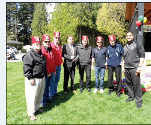
The Fraser Valley Shrine Club gave $5,000 to Chilliwack General Hospital maternity for a blood pressure machine and $5,000 to the Live 5-2-1-0 Forum Project in Hope where they were on hand (along with Tre Player of the BC Lions, right) for the activities.